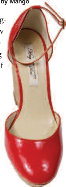
MNG by Mango

MNG by MANGO from Spain joins the "fast fashion" juggernaut that has customers checking weekly for new shipments. The store features clothing and accessories with inspirations ranging from yoga-loving model Christy Turlington to the French films of Jean-Luc Godard.