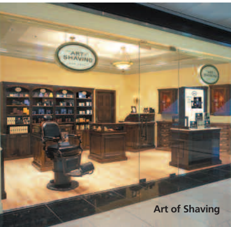
Art of Shaving