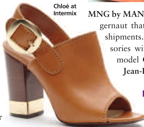
Chloé at Intermix

Intermix is well known on the East Coast for its "lifestyle" presentation of fashion and accessories. The design of each boutique is based on the curves of a woman's body. The racking systems snake throughout the store, encouraging shoppers to discover the next item. Personal stylists will offer advice on putting together just the right combination.