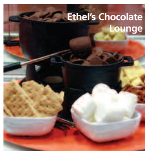
Ethel's Chocolate Lounge

Peter Lik uses a panoramic camera to capture images from stark deserts to water-drenched reefs and rainforests. Handcrafted timber floors and custom-designed furniture in his gallery provide a refreshing vacation feel.