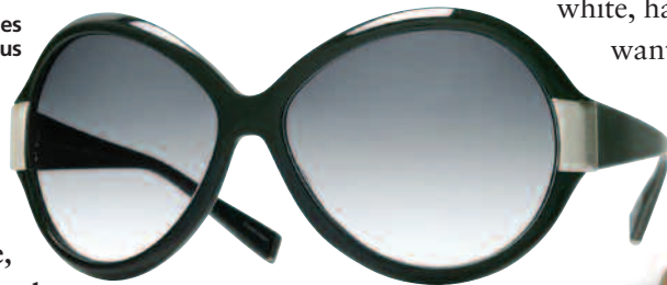
Oliver Peoples at Oculus

Oliver Peoples, Daniel Swarovski, Movado and Alain Mikli (who replicated the "Ugly Betty" glasses). Oculus can even do couture designs.